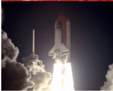
Space Shuttle Columbia Flight 1998